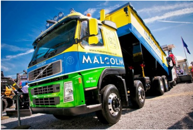
This smart new 420hp sleeper-cabbed FM eight-legger in WH Malcolm's colours certainly looks the business...