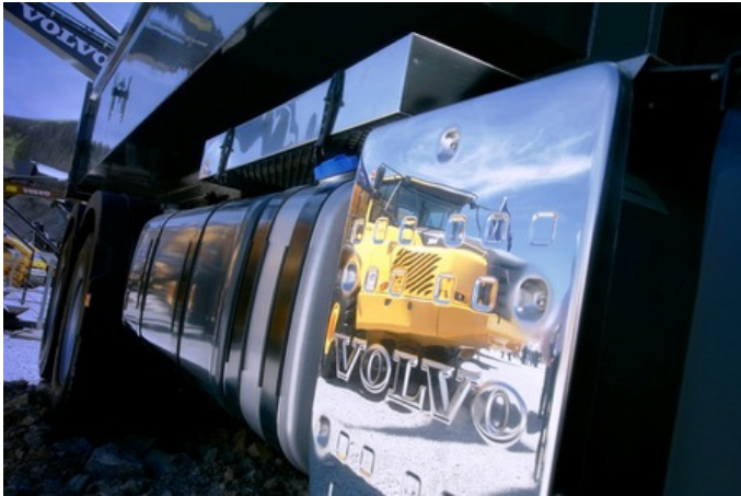
Blimey! Agent Reg is going all 'arty' now...nice reflected shot of a Volvo artic dumper in the FMX's super shiny silencer shielding...