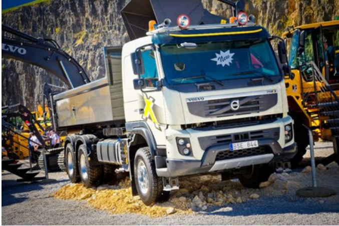
Naturally the Swedes made a big splash at Hillhead with the all-new FMX heavy-duty construction range--of which Biglorryblog has blogged on countless occasions! One tough tipper..